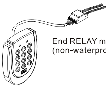
End RELAY module (non-waterproof)